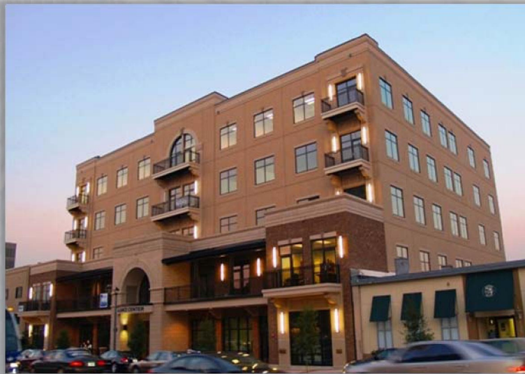
119 S. Monroe St., Tallahassee, FL